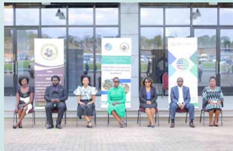
Delegates during the Crimes (Red flags) related to New Payment Methods Workshop