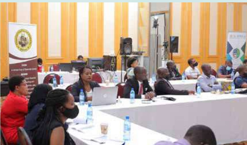
A cross-section of the workshop participants