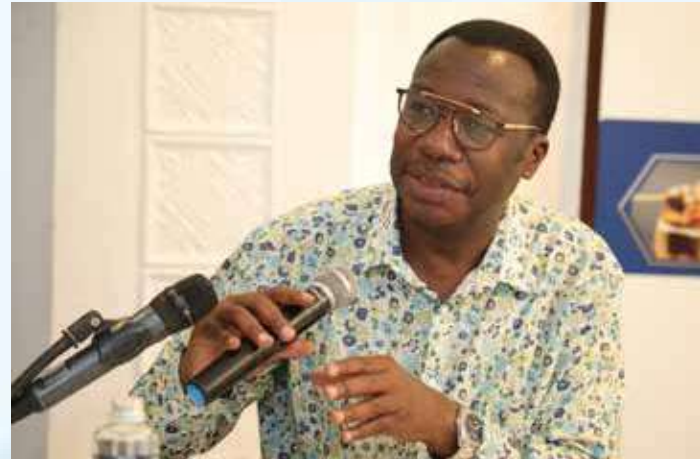
Hon. Justice Smokin Wanjala, Director of Judiciary Training Institute & Judge of the Supreme Court of Kenya speaking during the induction ceremony