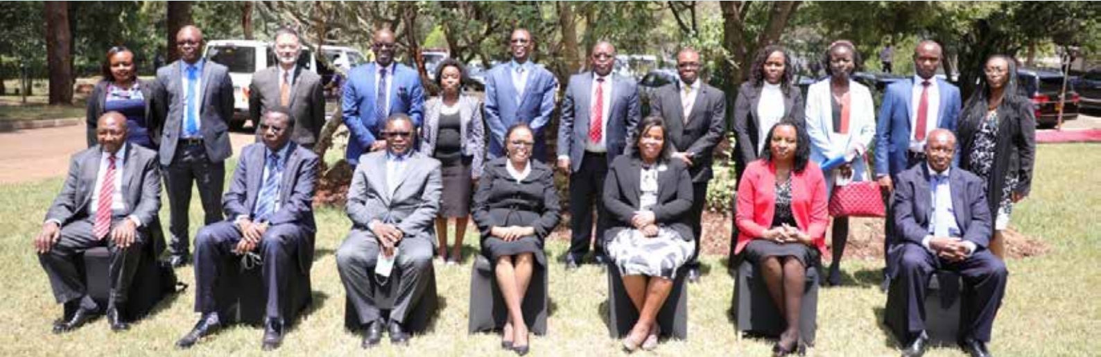
Hon Lady Justice Martha K. Koome, Chief Justice and President of the Supreme Court of Kenya with Hon. Paul Kihara, the Hon. Attorney General, Hon. Ken Lusaka, the speaker, National Assembly among other dignitaries during the inauguration ceremony