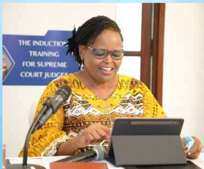
Hon. Justice Martha Koome, Chief Justice and President of Supreme Court of Kenya speaking during the induction ceremony