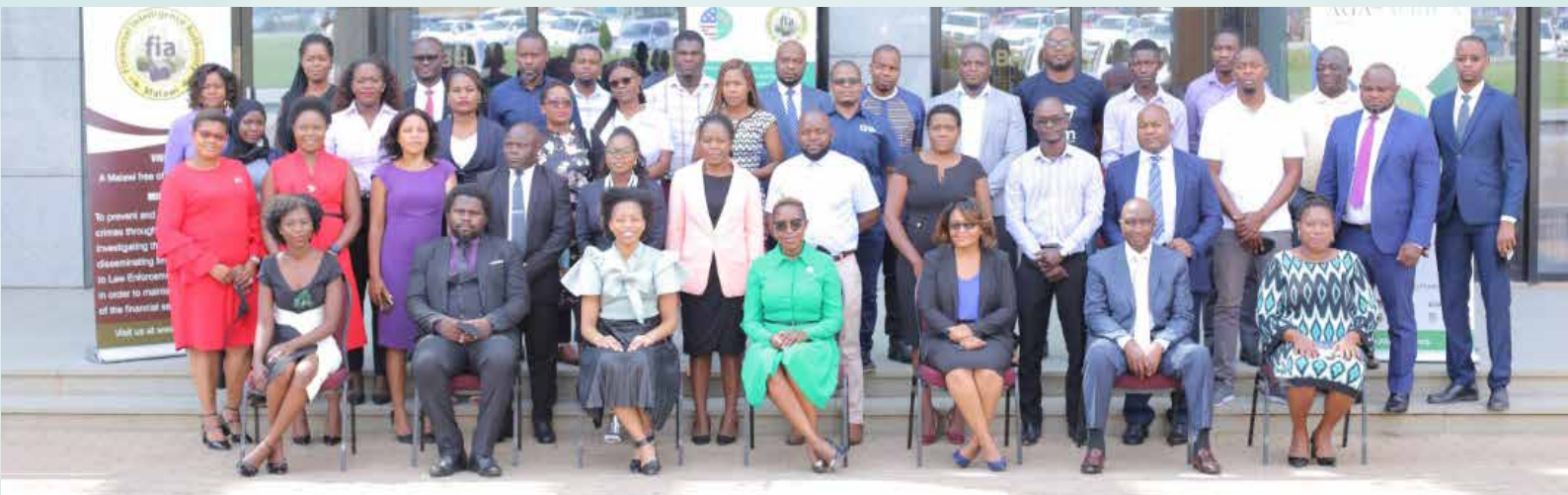
A group photo of participants during the New Payment Methods workshop

AGA-Africa in collaboration with the Financial Intelligence Authority of Malawi held a 2-day workshop on Crimes (Red flags) related to New Payment Methods from 27 th -28 th October 2021 in Lilongwe, Malawi. The workshop included rich sessions designed to equip the participants with knowledge and expertise required to identify the red flags indicators that may help them to detect financial crimes and increase the quality and quantity of suspicious transaction reports.