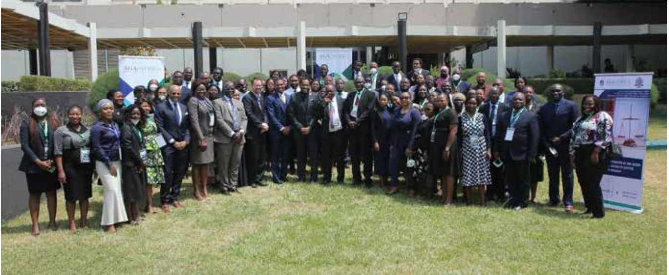
A group photo of AGA-Africa representatives, facilitators, workshop participants and other delegates