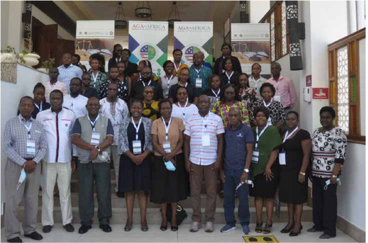
A group photo of the delegates during the training