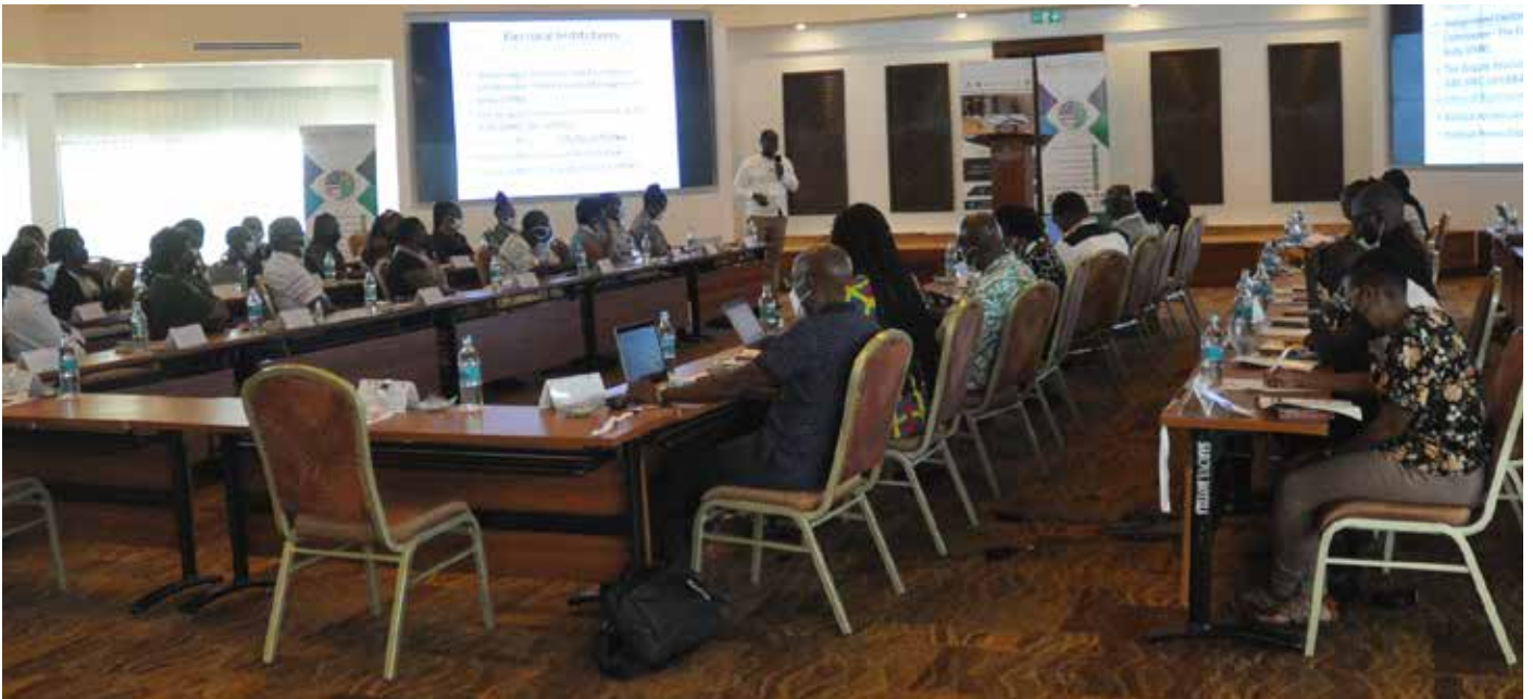
A cross-section of the participants during the Election Dispute Resolution Training for High Court Judges